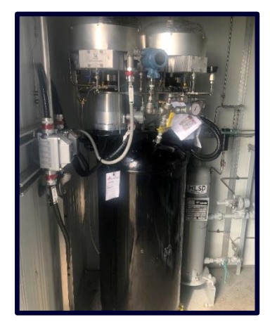
Low-power instrument air trial in action

Advantage strives for continuous improvement in emissions with current initiatives focused on further reducing emission intensity and venting. The Alberta Energy Regulator has implemented more stringent requirements starting in 2023, with Advantage well on track to meet and beat such standards. Low and zero-venting technologies are constantly evolving with trials underway such as low-power instrument air compressors coupled with power supply, such as solar panels. Advantage is also evaluating options such as instrument gas replacement with nitrogen and improved electric instruments. These efforts allow for continued reduced venting and improved operational effectiveness.