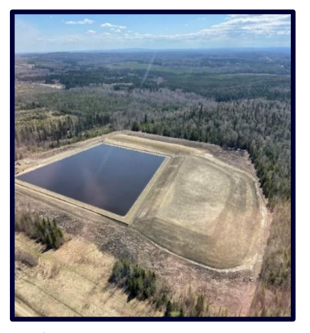
Fresh water reservoir

Advantage is committed to managing the impact of our water use. Water sourcing and disposal is required for resource extraction industries, including those companies that rely on horizontal drilling and hydraulic fracturing completion techniques. Advantage's water use increased in 2021 because of an increased drilling program and associated hydraulic fracturing operations with optimized fracturing design. The new design increases the amount of proppant that is pumped into the fractures, which improves the per-well resource recovery but similarly requires additional water. Advantage attempts to minimize the environmental impact of water usage by primarily utilizing secondary-use water in our operations. None of the secondary-use water sourced by Advantage is potable and would require additional treatment to meet specifications for human consumption.